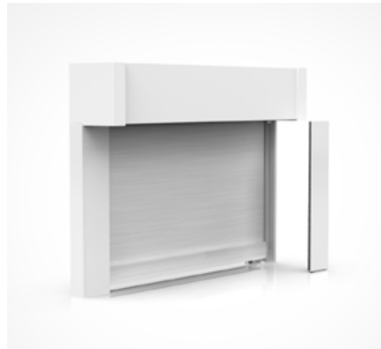
Edge Side Channels Improve light block

Internal wire guides are available for more complex shading solutions.