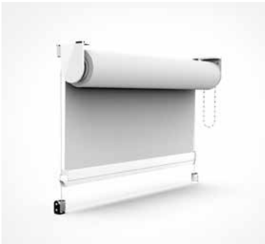
Internal Wire Guide For complex shading systems

Internal wire guides are available for more complex shading solutions.